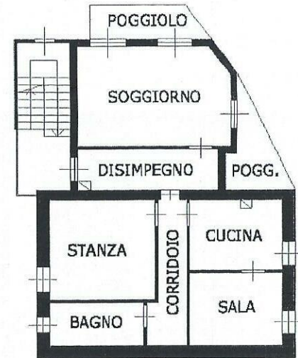
PIANO SECONDO SOTTOTETTO H = 2.63